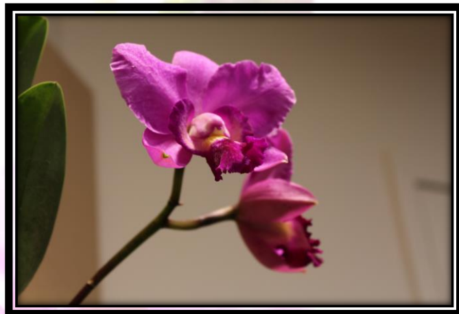
Lc. Carmela's Tropical Beauty "Hawaii"