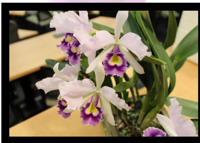
Lc. Brenda's Blue Eleanor SanFlippo