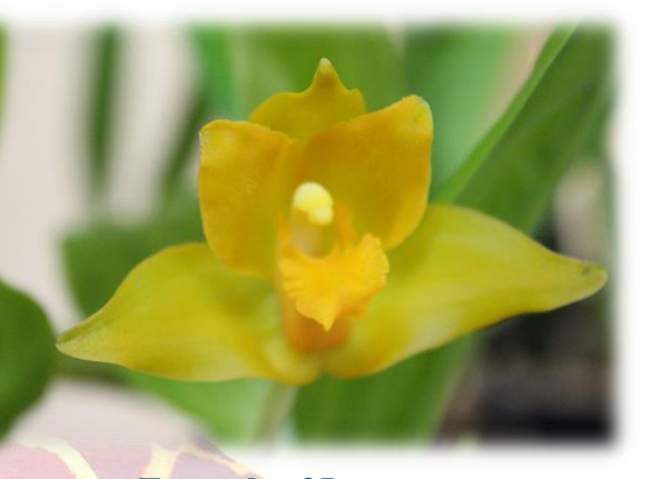
Example of Lycaste