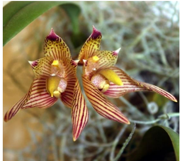
Bulbophyllum [Bulb.] Bicolor Jorge Li