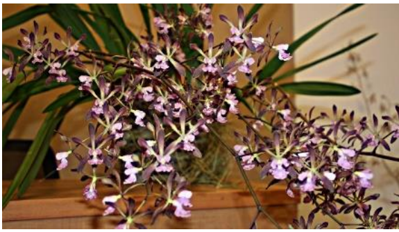
Encyclia [E.] Not Identified