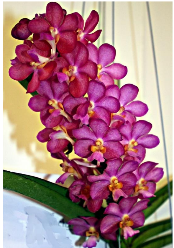
Rhynchorides [Rhrds.] Bangkok Sunset x Ascocenda [Ascda.] Wilas Jorge Li