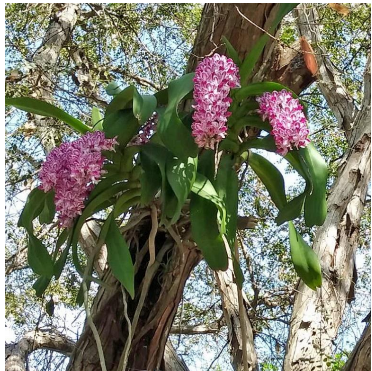
Zoo (Diane Dickhut)