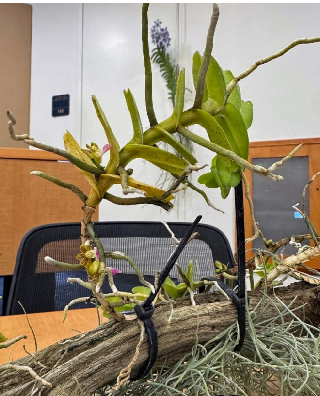
Pelatantheria insectifera