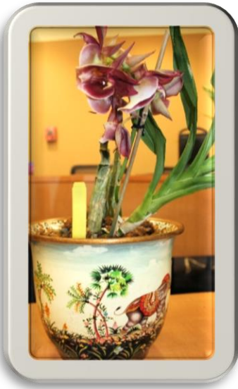
Cattasetum [Ctsm.] Olga Lorraine Lee