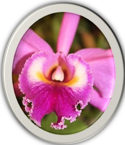
Cattleya Not Identified Person Not Identified