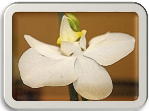
Phalaenopsis [Phal.] (syn. Doritaenopsis or Dtps.) Chia-Shing Focus Person Not Identified