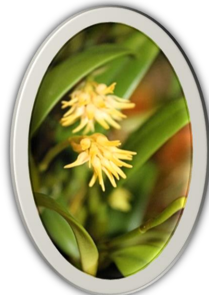
Bulbophyllum [Bulb.] odoratissimum (Species) Person Not Identified