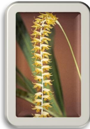
Dendrochilum [Ddc.] magnum Diane Dickhut