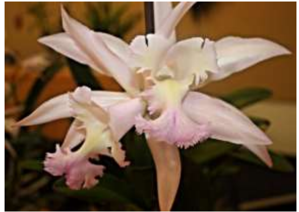
Rhyncholaeliocattleya [Rlc.] (syn. Brassocattleya or Bc. ) Cordelia Jorge Li