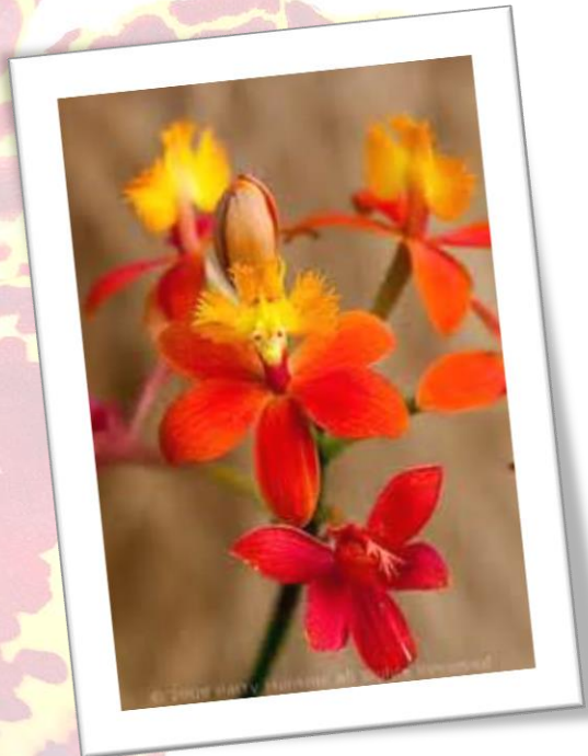
Example of Epidendrum “Epidendrum secundum”