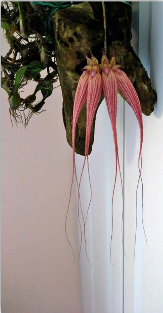
Diane Dickhut (Bulbophyllum 6-inch Tendrils)