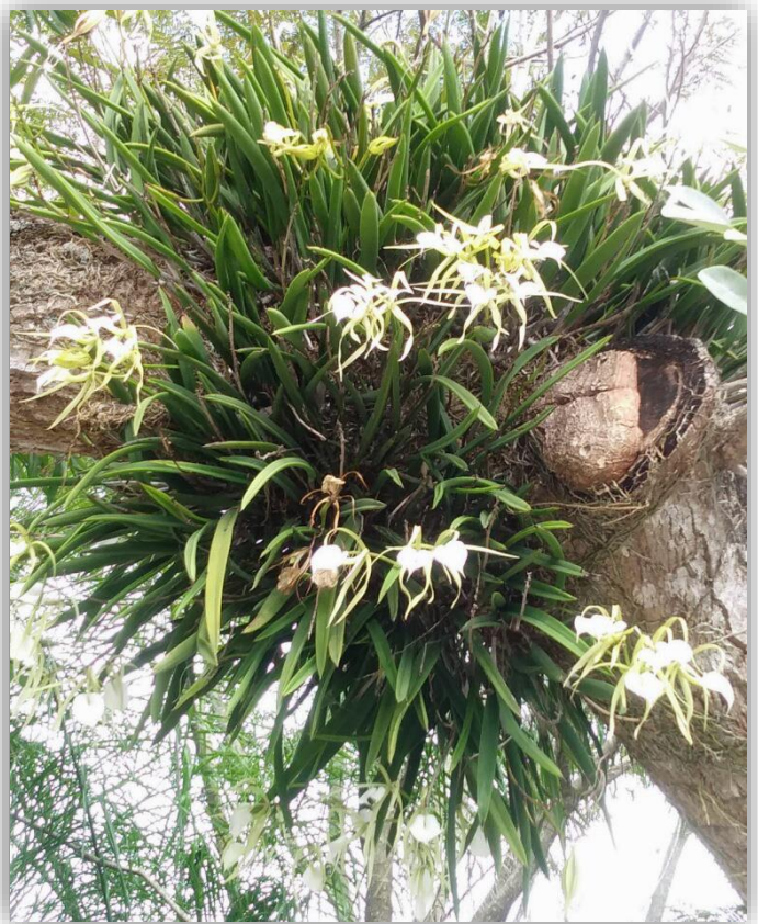
Diane Dickhut (Zoo Nodosa)