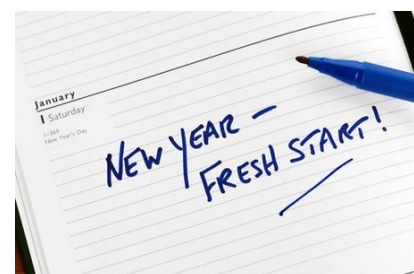
1 st Resolution – No Covid-19!!!