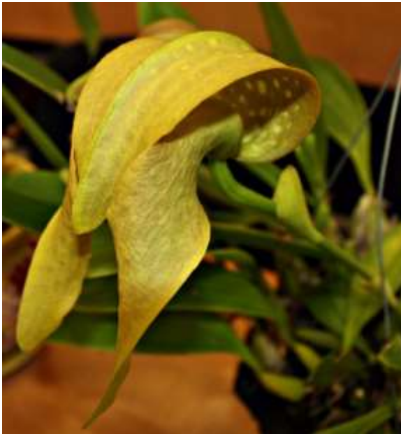
Bulbophyllum Grandeflorum Diane Dickhut