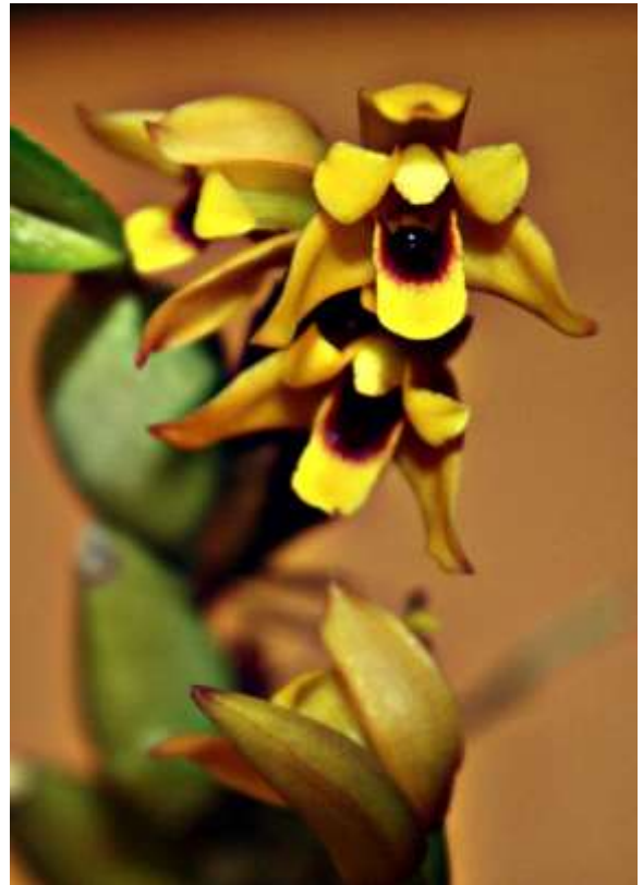
Maxillaria variabilis