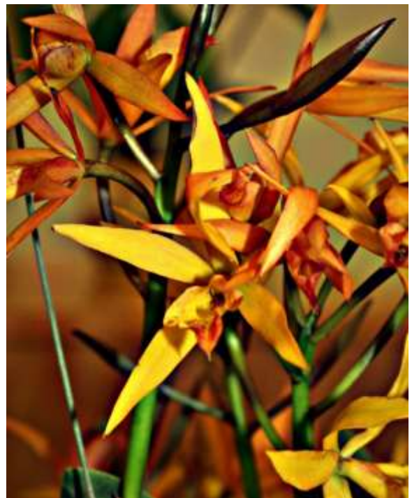
Blc. Lemon Yellow "Carib" CCH/AOS Rene and Lou Silva