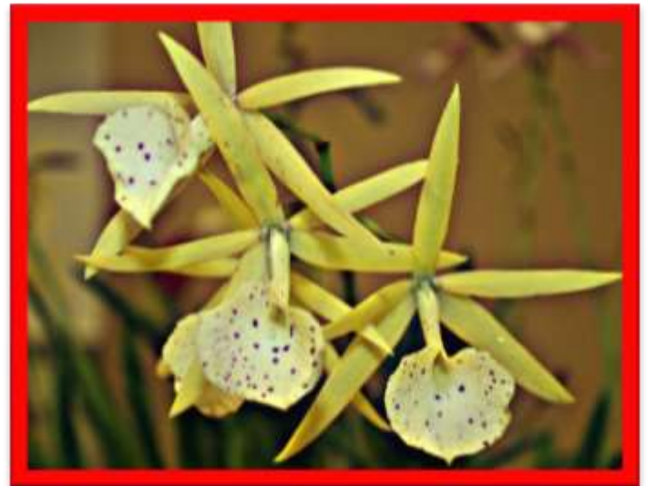
Brassolaelia [Bl.] Yellow Bird Rene and Lou Silva