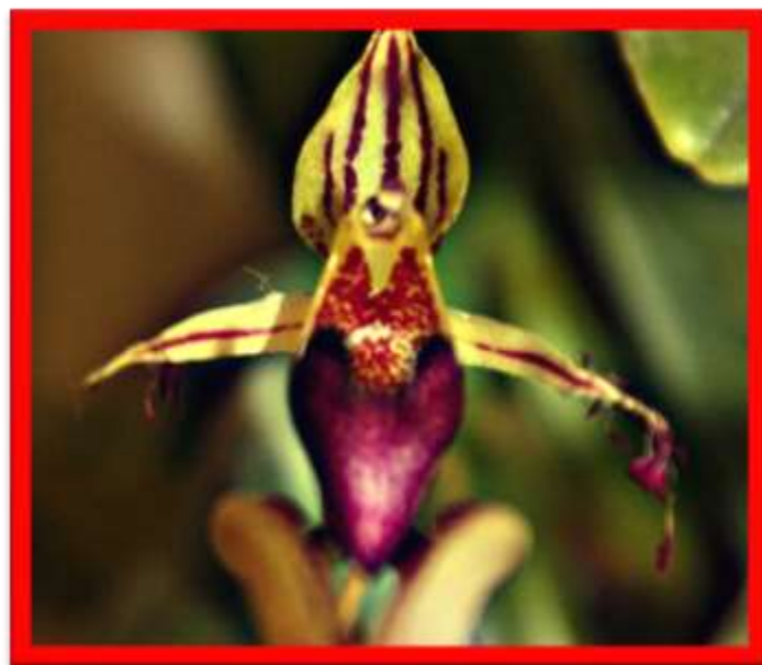
Bulbophyllum [Bulb.] putidum Diane Dickhut