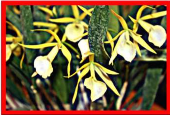
Brassavola [B.] Little Stars x Brassolaeliocattleya [Blc.] Lyn Spring Rene and Lou Silva