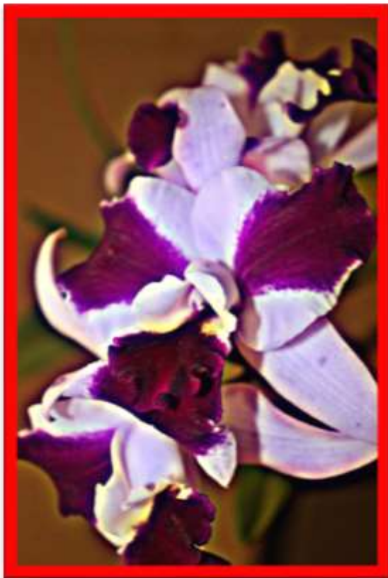
Zoo Miami - Not Identified Barbary Lutz