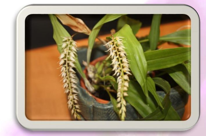
Unknown Diane Dickhut