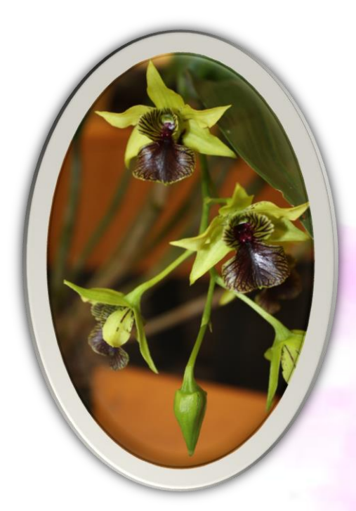
Den. Little Green Apples Green Elf x Convolutum Diane Dickhut