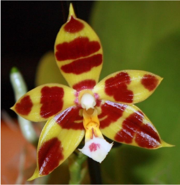
Phalaenopsis Norman's Mini Eagle Jorge LI