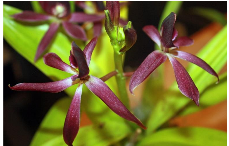
Circ. Blue Comet Enc. Cochleata x Guarechea Mivaetolle Noire "Indigo Blue" Jorge Li