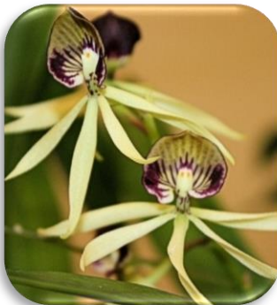
Cochleata No ID Diane Dickhut