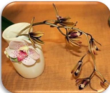
Cymbidium No ID Diane Dickhut