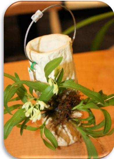
Dendrobium [Den.] delacourii